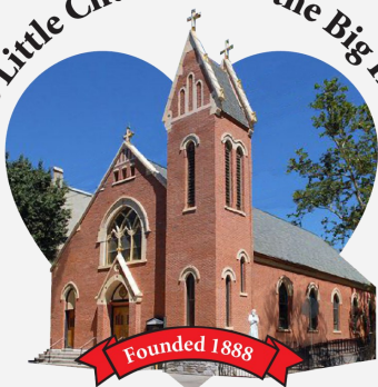
St. Francis Church Hoboken, NJ